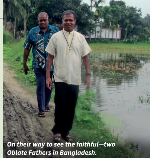
On their way to see the faithful—two Oblate Fathers in Bangladesh.

The priests teaching in seminaries are also most grateful for your Mass intentions. The spiritual formation of the young seminarians requires the greatest care and attention, which leaves the priests involved with very little time for parish work. You are helping by providing regular support for the priests at the seminary in Barrackpore, in the Indian state of West Bengal, among others. The seminary has the beautiful name of the ‘Morning Star Seminary,’ as it is dedicated to the Virgin Mary (see Pope St. John Paul II, Redemptoris Mater , 3). Here, young men from 30 different dioceses and several religious communities are training for the many challenges they will face as priests in India. Many of them will be sent to work in the extremely poor and remote regions